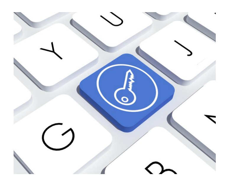
*Someone uses your personal information without your knowledge to commit fraud or theft.